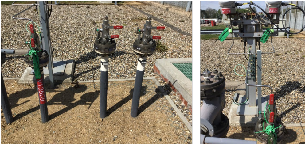
Figure 3: Perenco A1 Incomer Stabbings and Pressure Switches

5.12. Additional pressure stabbings are also being installed to Perenco A2 incoming line which will mirror the revised arrangement on the A1 incomer with the addition of a third pressure sensor as shown in Figure 3.