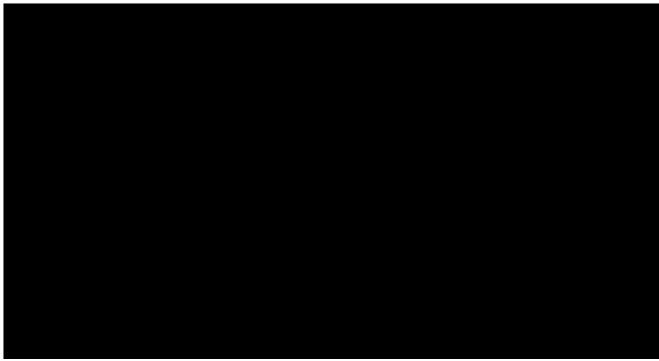
Figure 2: General Arrangement