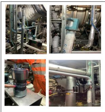
Mechanical pipe connection process

Lokring (supplier) trained several technicians to install a 2" mechanical pipe connection at one of our sites. The training included what steps were required at each phase of the installation; each step was evaluated and