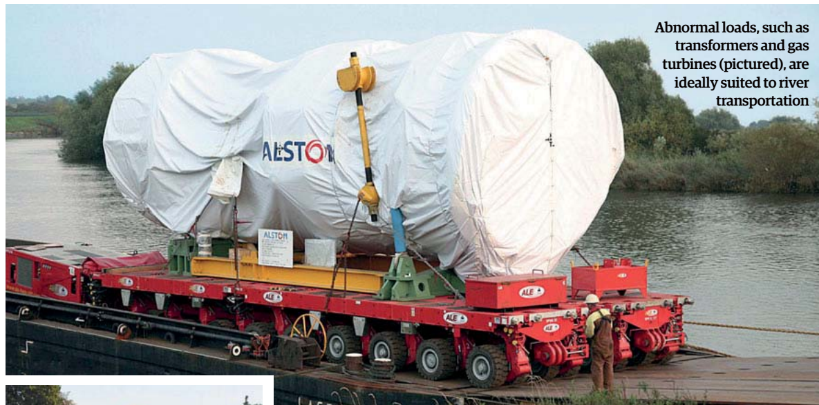
Abnormal loads, such as transformers and gas turbines (pictured), are ideally suited to river transportation

But lifting heavy loads has inherent safety risks, and the crane cannot operate in bad weather.