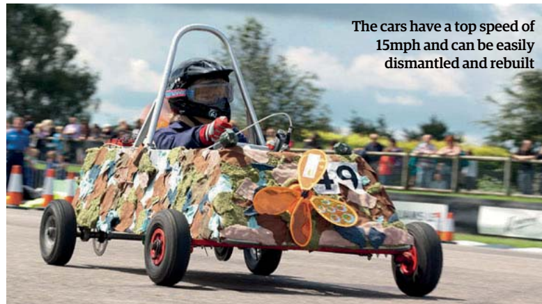
The cars have a top speed of 15mph and can be easily dismantled and rebuilt

The Bringing Energy to Life initiative supports local communities