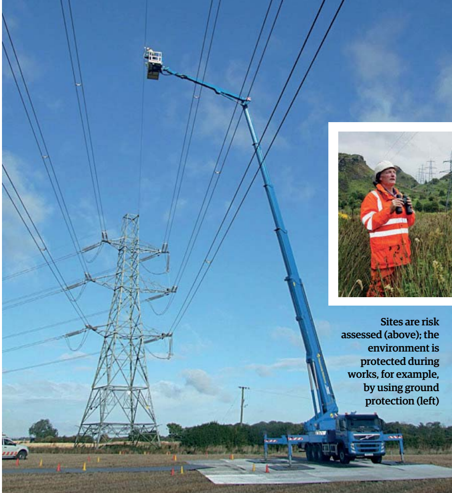
Sites are risk assessed (above); the environment is protected during works, for example, by using ground protection (left)