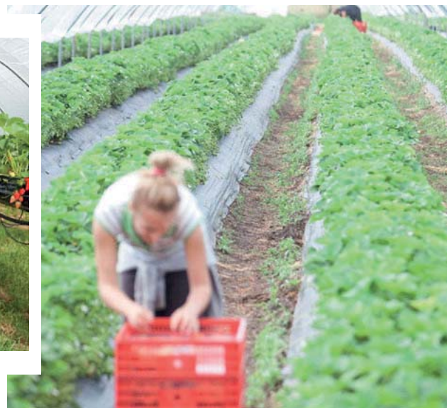
Pickers work from dawn until mid-afternoon grading all the strawberries by size and shape