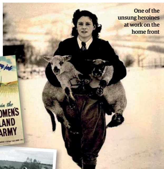
One of the unsung heroines at work on the home front