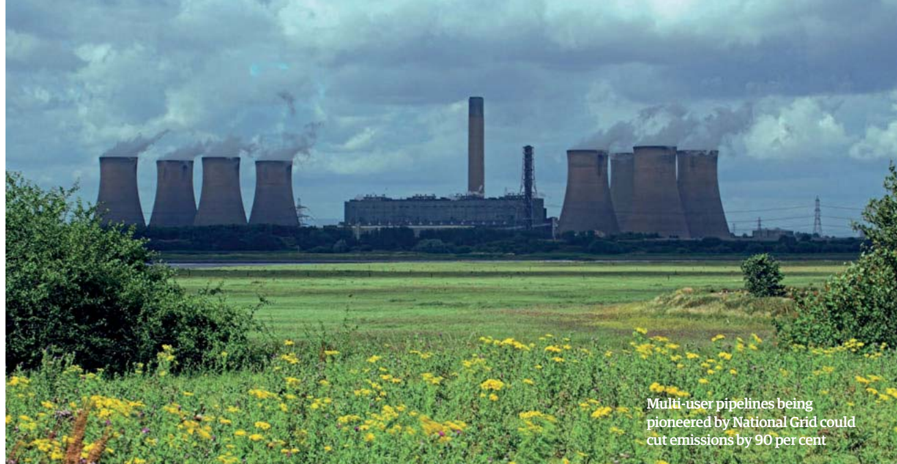
Multi-user pipelines being pioneered by National Grid could cut emissions by 90 per cent