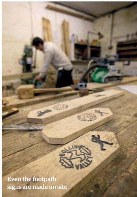
Even the footpath signs are made on site