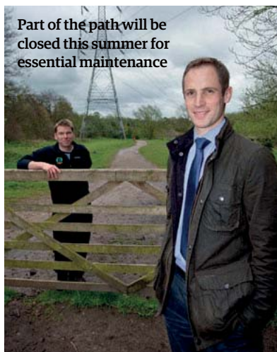
Part of the path will be closed this summer for essential maintenance