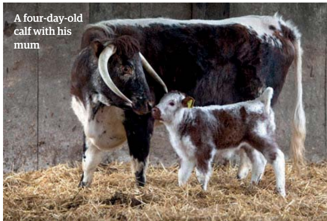
A four-day-old calf with his mum

joined the project as a ranger more than 30 years ago.