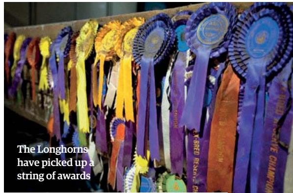
The Longhorns have picked up a string of awards