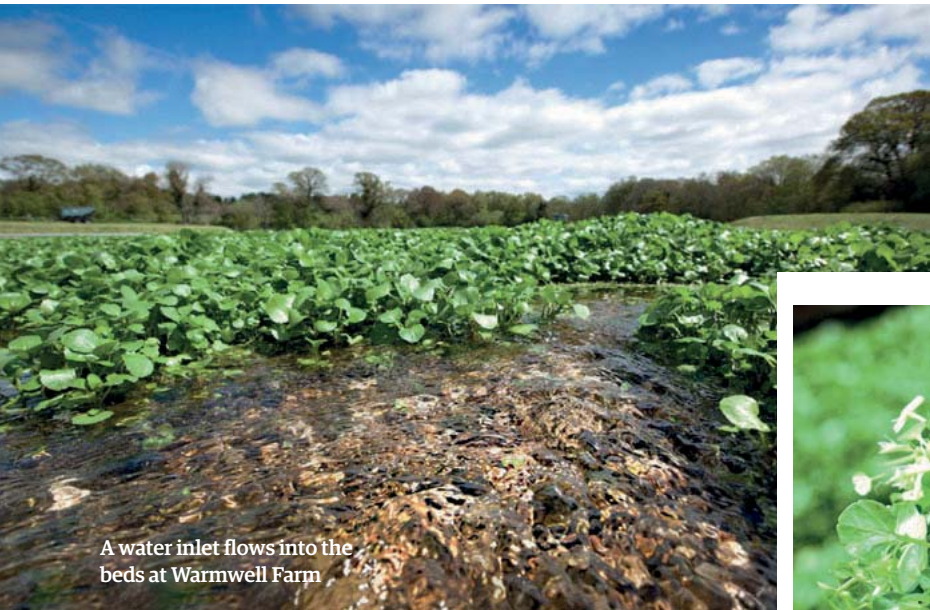
A water inlet flows into the beds at Warmwell Farm