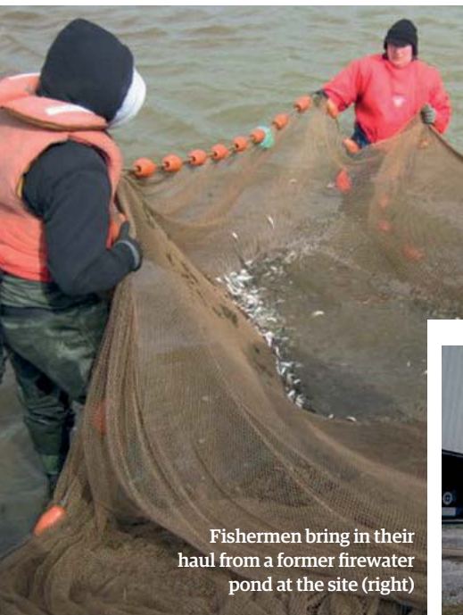
Fishermen bring in their haul from a former firewater pond at the site (right)

LOCAL ANGLERS ARE REELING in the benefits after a gas storage facility in Greater Manchester was decommissioned.