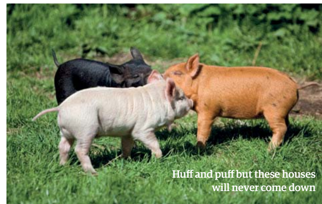
Huff and puff but these houses will never come down

"The eco credentials of the project are very important, but the cottages will also have all the mod cons," said Harriet. "We drew the line at composting toilets."