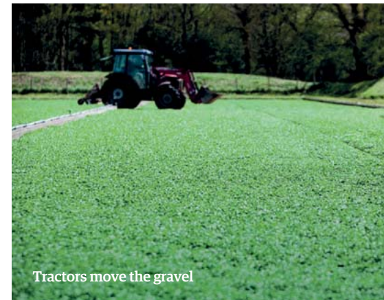
Tractors move the gravel