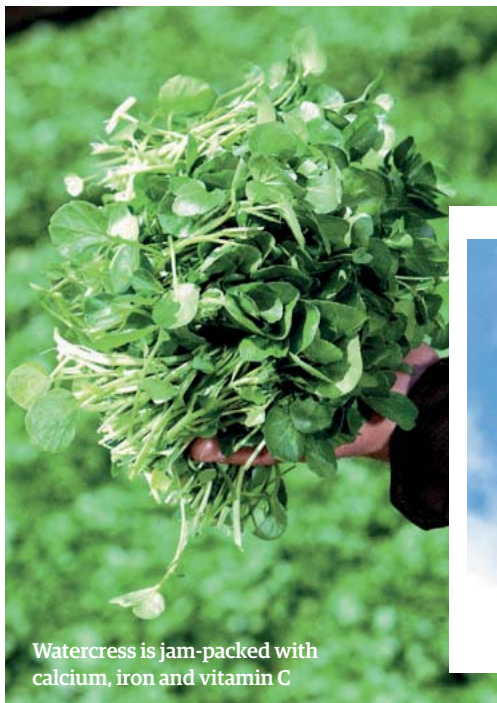
Watercress is jam-packed with calcium, iron and vitamin C