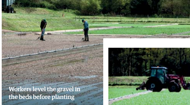
Workers level the gravel in the beds before planting