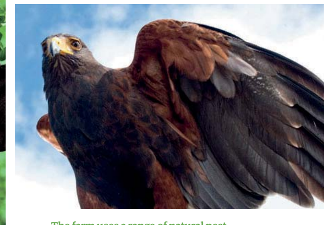
The farm uses a range of natural pest controls, including Harris hawks

I n drought-hit southern England it comes as something of a surprise to meet a farmer who isn't praying for rain.