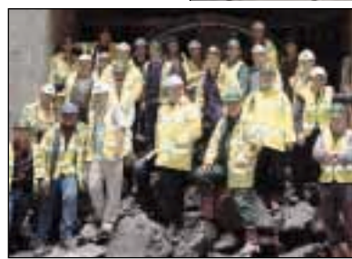
Inside part of the tunnel, above, and inset, members of the tunnel team