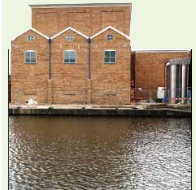
City Road substation project has been completed

Meanwhile, National Grid has continued to support local charities, such as the Islington Boat Club and Groundwork, and, for the third year running, helped fund the Angel Canal Festival, which features many local charities.