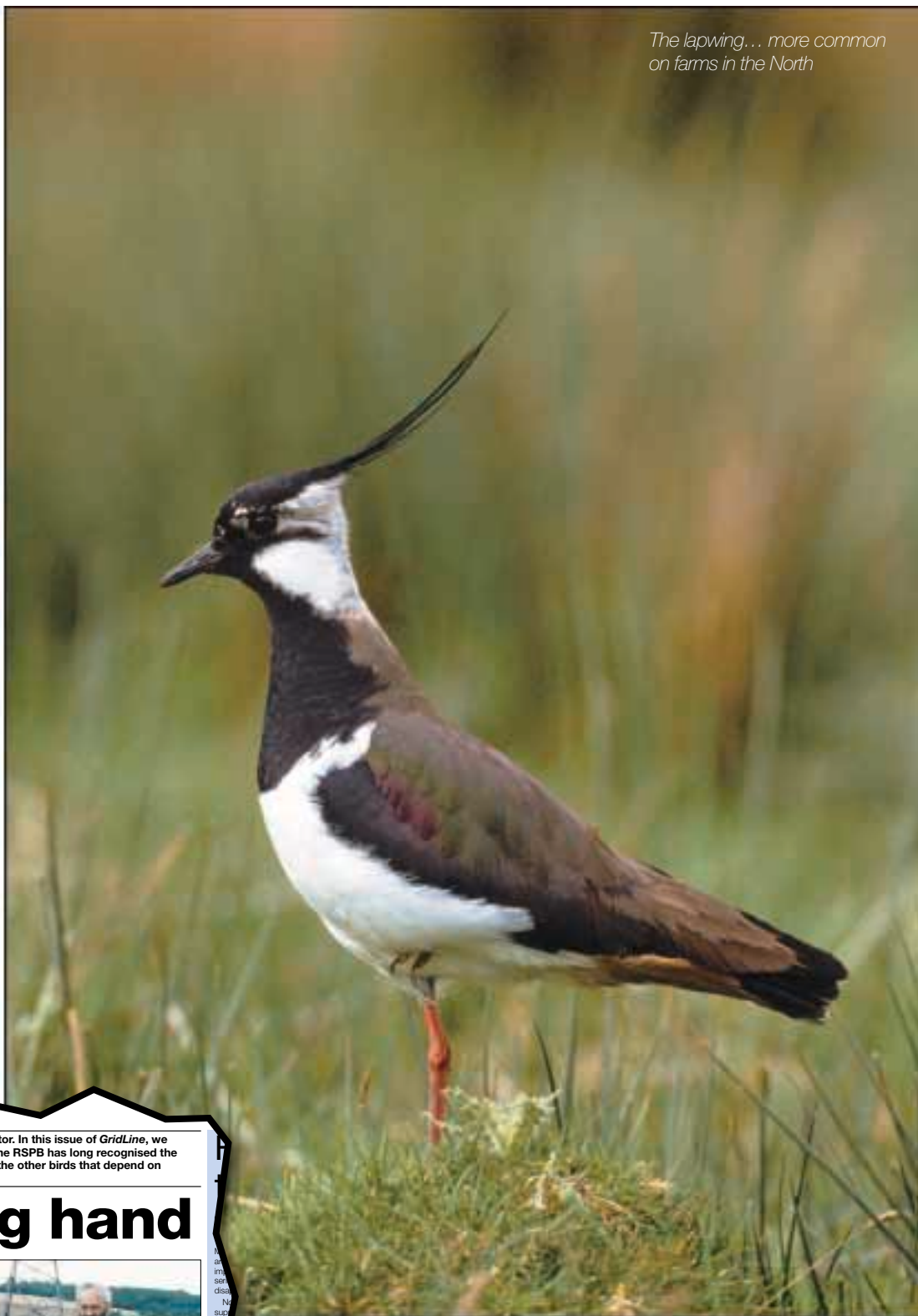
The lapwing... more common on farms in the North

NEWS THE Royal Society for the Protection of Birds (RSPB) is a large landowner in the UK — and a National Grid grantor. In this issue of GridLine , we introduce a new RSPB initiative launched at this year's Royal Show, the RSPB Volunteer and Farmer Alliance. The RSPB has long recognised the vital role farming must play if we are to reverse the alarming declines in skylarks, song thrushes, lapwings and the other birds that depend on farmland. The alliance highlights the society's commitment to work with farmers to reverse this decline.