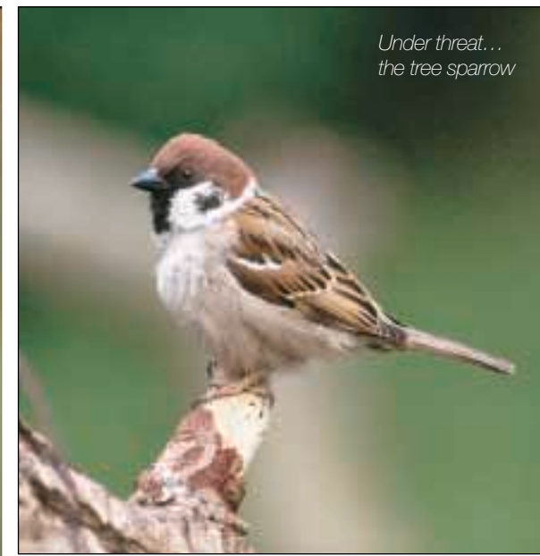
Under threat... the tree sparrow